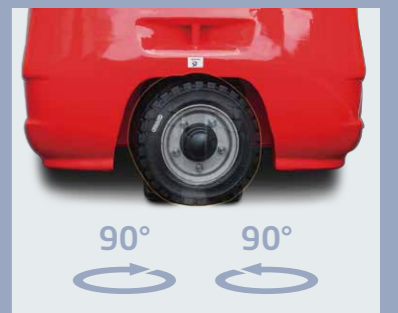
The small turning radius is suitable for narrow channel