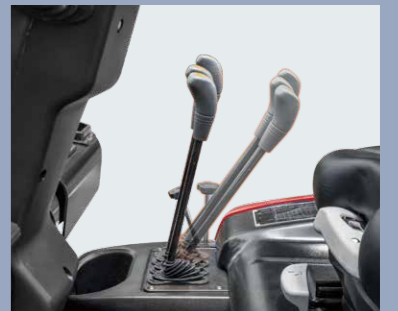
Cover can be easily opened by adjusting the levels forward