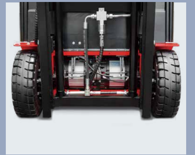
Front dual separated motors