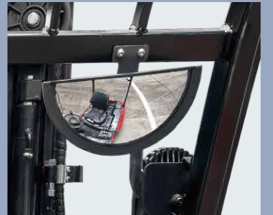
Panoramic rearview mirror